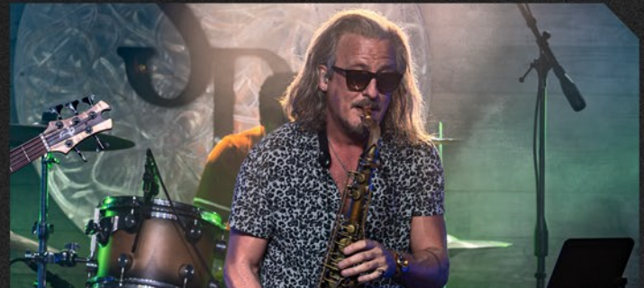
WILL SMITH SAXOPHONE

OFFICIAL SITE HTTPS://PHBPRODUCTIONS.COM