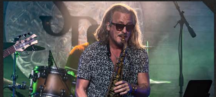
WILL SMITH SAXOPHONE